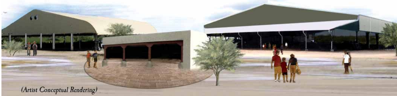
(Artist Conceptual Rendering)